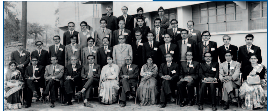
First Conference of the Association of Clinical Biochemistry of India held at Patna, Bihar, India from 18 – 20 January, 1975